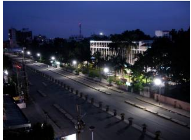
Energy efficient street lighting in Indore

Starting with nine cities, AEL drew on successful examples in developed countries to address barriers to enter the ESCO business, an uncharted territory in the Indian context. General barriers included the lack of standard tender documents, monitoring and verification protocols, and technical competencies among municipal staff. There were also difficulties in establishing energy baselines in order to assess potential savings that could result from the projects. Municipalities, with their present poor financial situation, face numerous constraints in undertaking capital expenditures for modernization and energy efficiency. AEL's first challenge, therefore, was to convince the municipalities that the ESCO model would be financially advantageous to them.