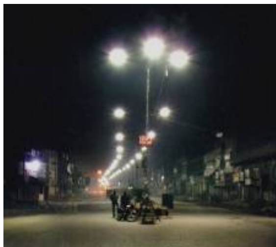
A main street in Amritsar with energy efficient lighting

AEL has set up similar control rooms with an array of computer-controlled monitoring systems in eight other Indian cities, including Indore, Ujjain, Latur, Akola, Amritsar, Alwar, Bikaner, and Hissar. The control rooms, which were established under Energy Service Company (ESCO) contracts for municipalities under a public-private partnership, monitor citywide street lighting systems.