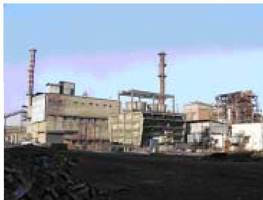
Mahendra Sponge & Power Ltd. sponge iron plant

“There is a potential of producing about 500 MW of power through waste heat removal units with an annual carbon credit of 1.5 million certified emission reductions.”