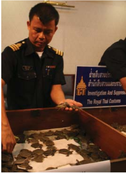
Bussara Tinsakyanjan / Wildlife Fund Thailand