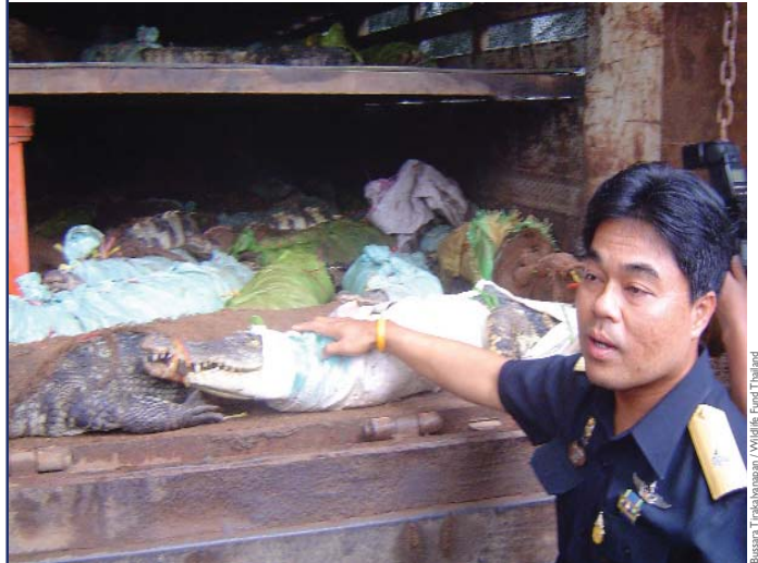
Every year, millions of dollars worth of illegally harvested animal and plant species are trafficked and sold in Southeast Asia.

IMPLEMENTING PARTNERS Government of Thailand, Wildlife Alliance, Peunpa, TRAFFIC, ASEAN, U.S. State Department, U.S. Fish and Wildlife Service, U.S. Justice Department, U.S. Forest Service, CITES Secretariat